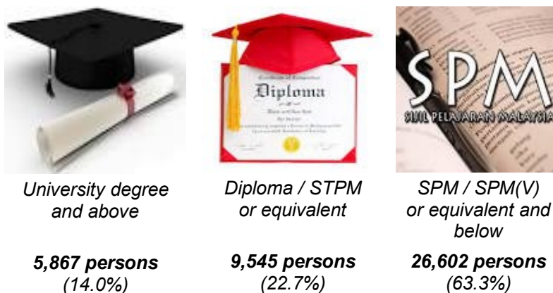
Chart 3: Employment by academic qualification, 2012