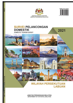
Wilayah Persekutuan Labuan