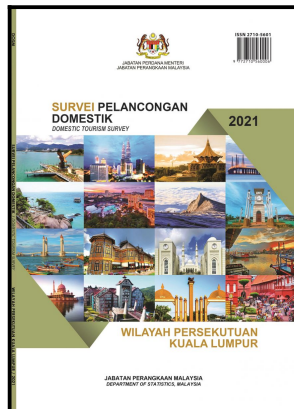
Wilayah Persekutuan Kuala Lumpur