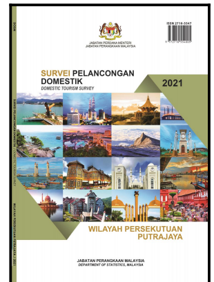
Wilayah Persekutuan Putrajaya