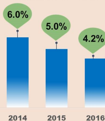
Annual 2014 - 2016